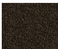
Deep Night 01