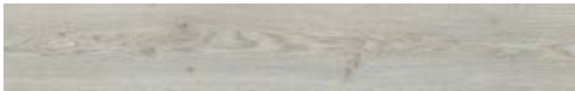
9783 PLANED WHITE OAK