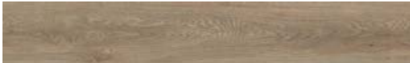
9786 DAPPLED OAK