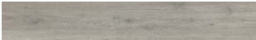
9739 OYSTER BIRCH