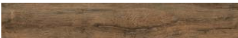
9792 FLAMED CHESTNUT