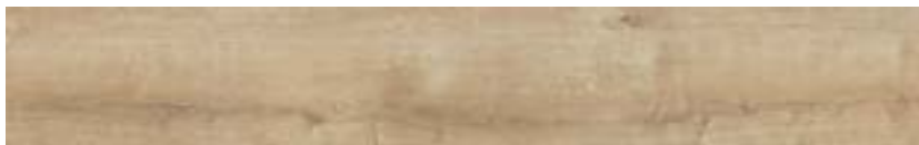
9785 CHAMPAGNE OAK