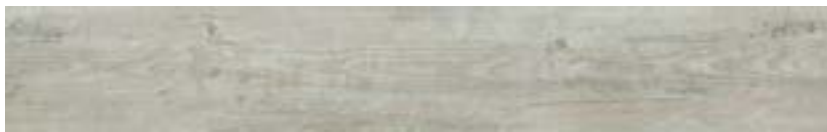
9782 CRACKED WHITE OAK