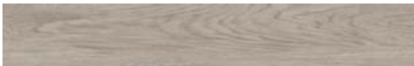
9784 FRENCH LIMED OAK