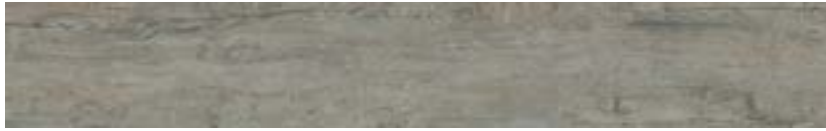
9795 SEASONED GREY OAK